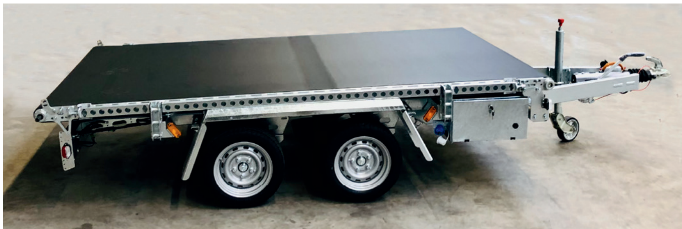
Electrically operated conveyor belt with gear transmission